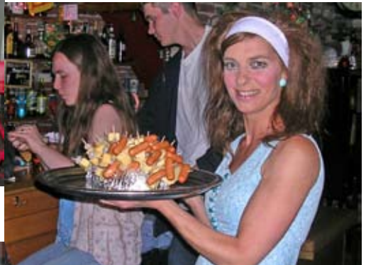
There was even authentic food in the form of cheese & pineapple and sausages on sticks.