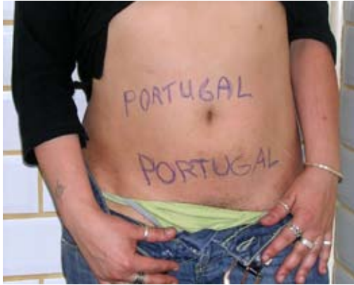
Can't remember if this person said we could print her name, so we won't. Guess where she comes from though?