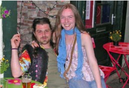
A couple of hippies disguised as Vlatko and Nicola were hanging around outside.