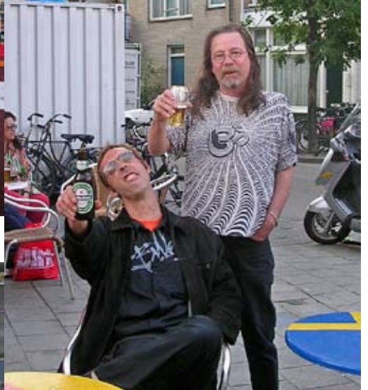
Susie's Saloon's terrace stays busy until well after sunset; ask Vera.