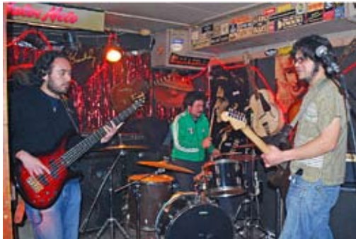
Three guys from Mexico did a set at the Thursday Blues & Rock session in Maloe Melo. I didn't know any of the songs, but they sounded pretty good. Who knows? Maybe they're world famous in Mexico.