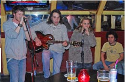
The Sharpees, a good, honest, rocking band of English guys who know their stuff, played a very enjoyable gig in Molly Malone's, mixing great covers with original material.