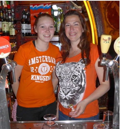
Angelica was in town on Kings Night and posed with Shakira in Café Oporto.

Get the latest updates from the Amsterdam Stun in Your Facebook News Feed