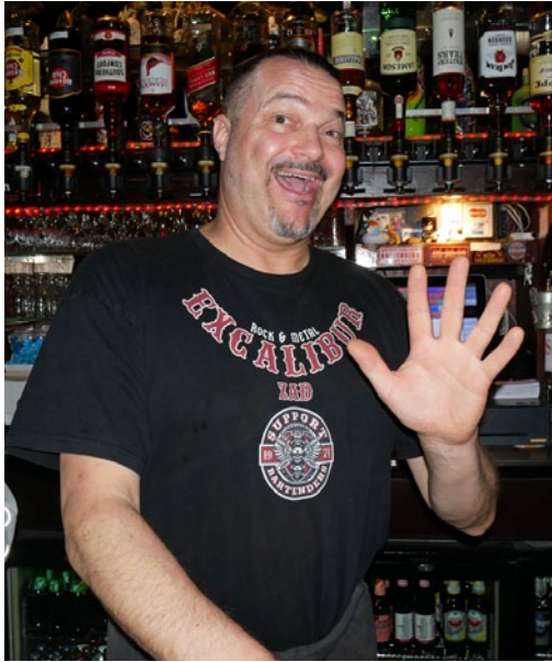
Zad in Excalibur notched up five years without alcohol on the 1st of April! No joke and it can't have been easy when you work in a bar in the Red Light District.