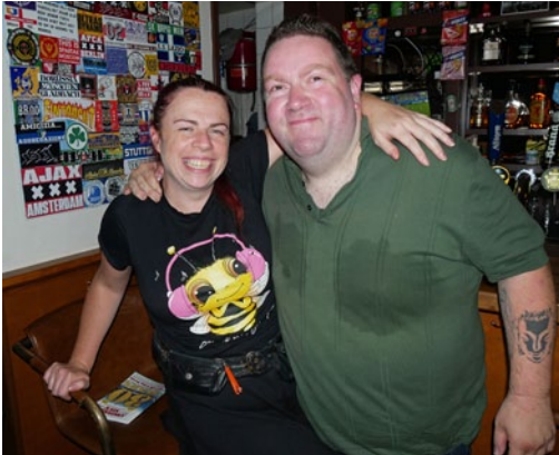
@backstagebaramsterdam @guinness_gal @bklein85 #WTF